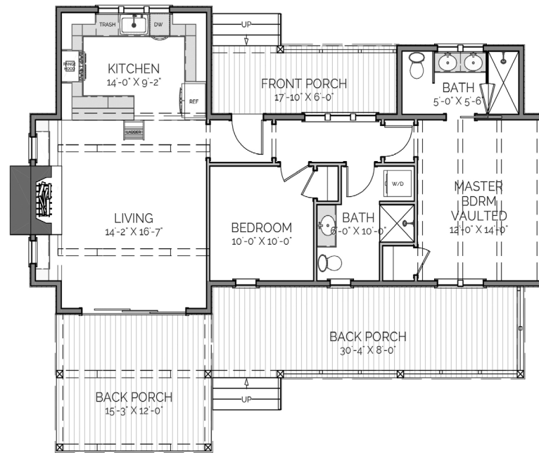
LIVING AREA 1000 SQ FT FIRST FLOOR PLAN