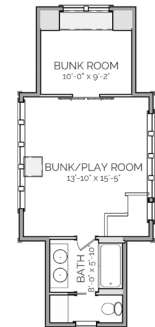
LOFT FLOOR PLAN